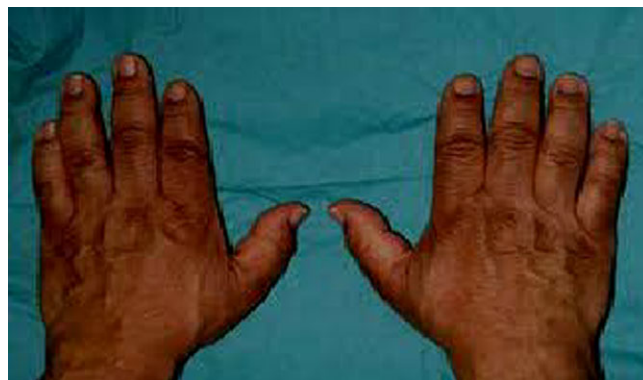
FIGURE 4 The patient's hands after anisodamine therapy

In conclusion, this case suggests that careful attention should be paid to amphotericin B-induced acrocyanosis and majorly elevated serum creatinine in elderly patients with a history of smoking and impaired renal function. Anisodamine was used to treat acrocyanosis and pain and the amphotericin B was discontinued. The results need to be further confirmed in a large randomized