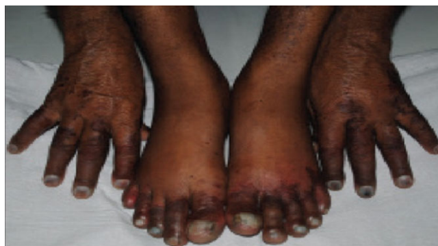
FIGURE 3 Cyanosis in the patient's hands and legs

The possible predisposing factors in this case included renal impairment and the patient's advanced age, which would have been responsible for the elevated serum creatinine as amphotericin B is excreted through the kidneys and the nephrotoxicity was due to the accumulation of the drug in the kidneys. Our patient's renal impairment and advanced age would have increased the potential for this accumulation. 3-5 In this case, amphotericin B could have led to liposome-induced elevated serum creatinine because of drug-induced nephrotoxicity. It was not clear whether amphotericin B liposome-induced acrocyanosis and pain were related to impaired renal function; it should be noted that the patient had a history of alcohol and smoking for 40 years. Smoking is associated with Raynaud's phenomenon, 6 Buerger's disease, and impaired peripheral vasculature endothelium-dependent vasorelaxation, which might be a considerable risk factor. 7 Anisodamine is used for the treatment of acrocyanosis and pain; it has membrane stabilization and cell-protection action (which is probably related to its calcium antagonist action) and it reduces the serum creatinine level. 8