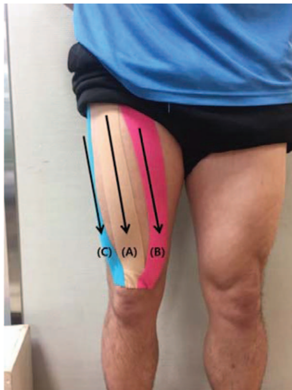
Figure 2. Application of the kinesiology tape in the origin-to-insertion direction.