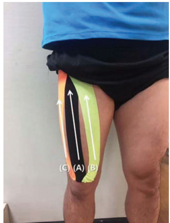
Figure 3. Application of the kinesiology tape in the insertion-to-origin direction.