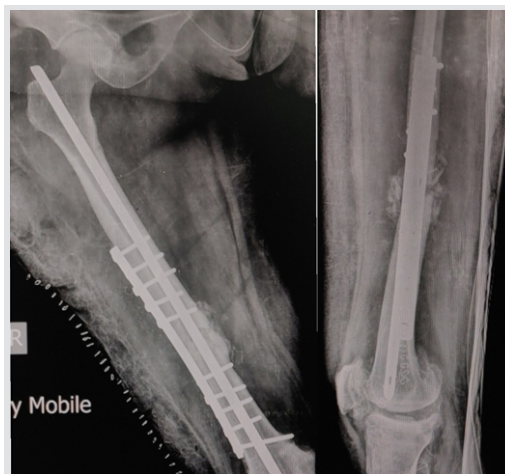
Figure 4: Radiograph of revision surgery showing fixation with exchange K-nail, augmented plating, osteoperiosteal flaps, and iliac crest bone grafting.