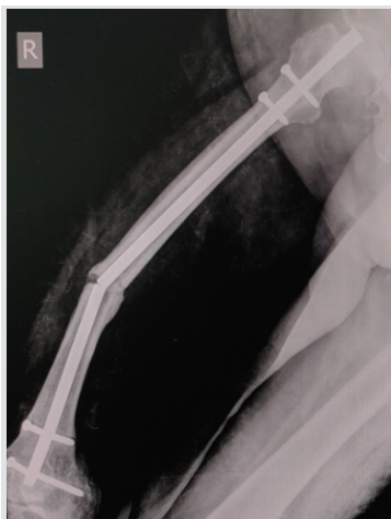
Figure 3: Radiograph of the right femur showing refracture with segmental breakage of the nail with minimal callus formation.

with thigh pain after getting up from sitting position. Clinical examination showed varus deformity of the right thigh with radiographs showing refracture with segmental breakage of the nail at the level of fracture and distal bolts with minimal callus formation (Fig. 3). This led to the impression that the AFF in the diaphyseal region did not unite in 9 months. Subsequently, the patient was treated with exposure of the fracture site, removal of the nail, and fibrous union. The sclerotic bone ends were removed until there was punctuate bleeding from the bone ends. The fixation was performed with K-nail and augmented plating, as shown by Sancheti et al. [9] and was supplemented with osteoperiosteal flaps and iliac crest bone grafting (ICBG) (Fig. 4). Postoperatively, the patient was started on active exercises and non-weight-bearing walking with walker support on day 2 and was discharged from the hospital on day 5. The patient was followed up regularly at 1-month intervals. The radiographs at 3 months showed good callus formation and the patient was advised to complete weight-bearing. The fracture healed successfully at 6 months and the patient started walking without support. At 1-year follow-up, the patient had full hip and knee range of motion and radiographs showed complete