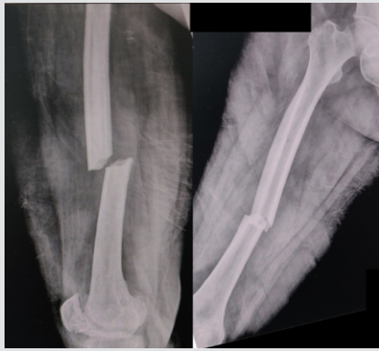
Figure 1: Radiographs of the right femur showed a complete fracture of the right femur shaft at the isthmus with the transverse lateral cortex, medial spike, and increased cortical thickening suggestive of atypical nature of this fracture.