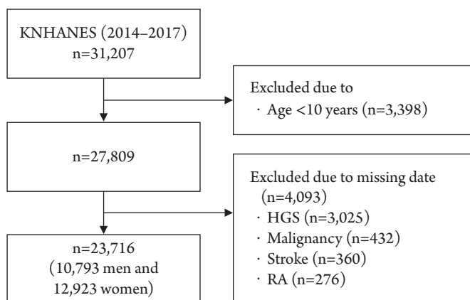
Fig. 1. Flow diagram of the study participants. KNHANES, Korea National Health and Nutrition Examination Survey; HGS, handgrip strength; RA, rheumatoid arthritis.

The mean age and BMI of the 23,716 participants were 46.3 \pm 19.7 years and 23.5 \pm 3.7 \text{ kg}/\text{m}^2 , respectively. The men were younger than the women ( 45.7 \pm 20.0 vs. 46.9 \pm 13.9 years; p < 0.001 ). Education level, household income, and their differences according to sex are shown in Table 1.