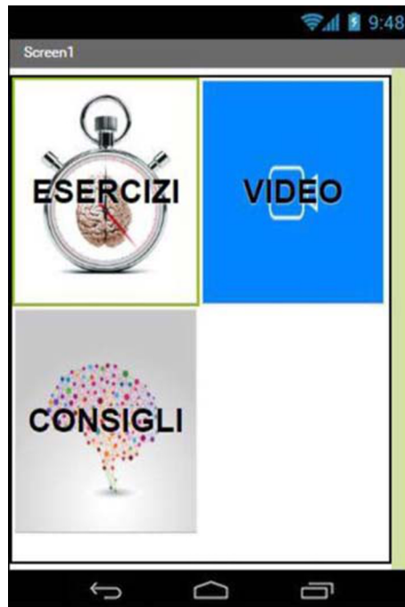
“EXERCISE, VIDEO, ADVICES.”