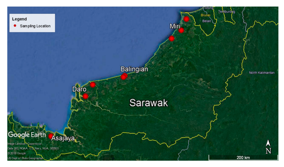
Figure 3. Sampling locations of Ganoderma basidiomata across oil palm plantations in Sarawak.

A total of 117 G. boninense basidiomata were collected from 107 BSR and 10 USR standing infected oil palm trees planted on peat in eight locations throughout Sarawak. These locations were then grouped together as local population representing their district or sub-district for analysis (Figure 3 and Table S3). A single basidiocarp was randomly collected from each diseased oil palm tree and treated as a single isolate. Field samples were brought to the laboratory for pure culture isolation. The surface of the basidiomata was cleaned with 70% (v/v) ethanol prior to isolation.