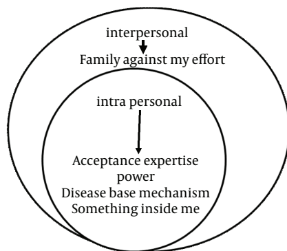
Figure 2. Behavioral Change Challenge Level

A stigma is an attribute that extensively discredits an individual, decreasing his or her from a whole and usual person to a tainted, reduced one. Major et al. (15) (1998) suggested that stigmatization happens when an individual possesses (or is believed to possess) an attribute or characteristic that projects a social identity that is undervalued in a particular social framework. Stigmatizing symbols may be obvious or invisible, manageable or unmanageable, and linked to physical appearance and behavior.