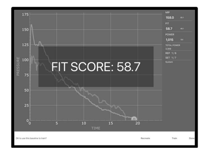
Fig. 1 User interface during Inspiratory Muscle Training with the PrO2FIT device and accompanying tablet application. The FIT score is a measure created by the PrO2 manufacturer and was not investigated in this case study.

function (Fig. 1). Each training session with the PrO2FIT device began with a baseline test created by a maximal effort breath where P1 was instructed to exhale to residual volume and inhale as fast and strongly as possible and then continue to inspire until total lung capacity was reached. P1 would then train at 80% of this maximum effort for 42 breaths as guided by the application, with visual and auditory feedback provided to reinforce MIP and SMIP training goals. The 42 breaths were performed in 7 sets of 6 breaths, with a decreasing amount of rest time between each active breath per set (i.e., Set 1 rest time: 40 s; Set 2 rest time: 30 s; Set 3 rest time: 25 s;...; Set 7 rest time: 5 s). Training sessions occupied 26 min on average. Rate of Perceived Exertion scores recorded in a logbook after each training session ranged from 3 to 7 on a 0-10 Borg Categorical Scale (mode: 6).