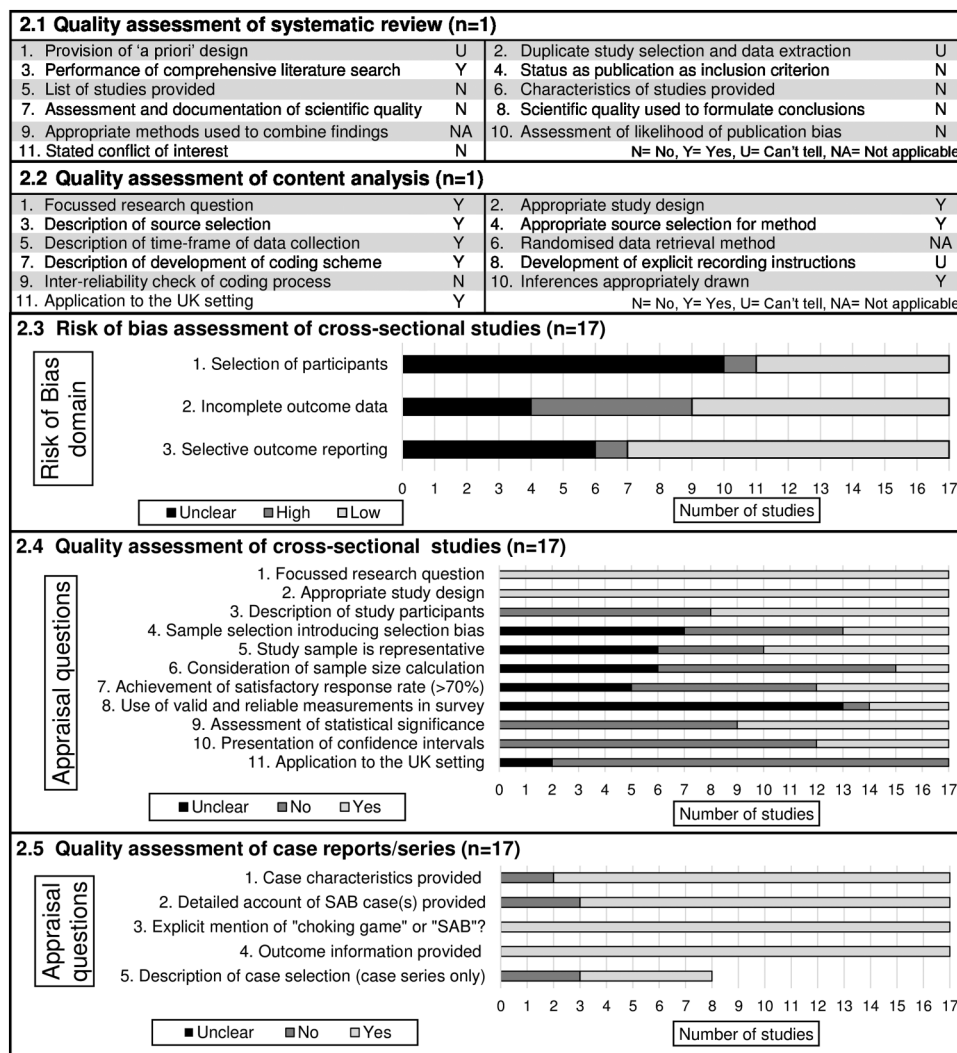
Figure 2 Findings from quality assessment of included studies. SAB, self-asphyxial behaviour.

A summary of quality assessment results is presented in figure 2. The systematic review was of uncertain quality as limited information was provided on its methodology; the content analysis