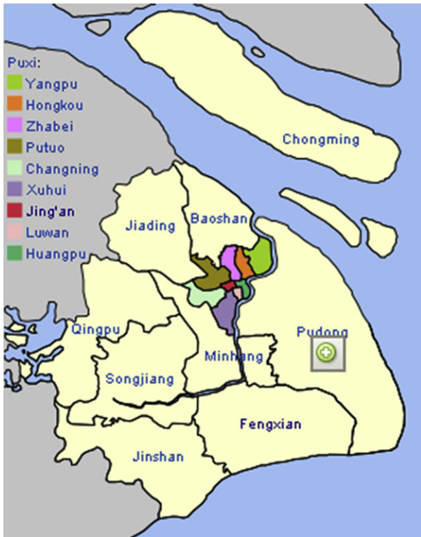
Figure 1. Shanghai is divided into 18 regions.

is currently slightly over 19 million, whereas the migrant population is about 6 million. Females account for about 50.1% of the entire population, slightly outnumbering males. The ratio of urban-to-rural population has been increasing for several years. The birth rate is one of the lowest in China, with 6.62 per 1000 persons (the rate for China overall is 12.13 per 1000 persons) and the mortality rate is 7.64 per 1000 persons. The average life expectancy at birth is 81.73 years (79.42 years for males and 84.06 years for females). Only 10.4% of the population is aged younger than 18 years, with 24.1%, 43.0%, and 22.5% being 18–34 years, 35–59 years, and at least 60 years old, respectively. The growing elderly population has resulted in an increased need for proper emergency care. In 2009, there were 2.7 doctors per 1000 persons and 4.1 hospital beds per 1000 persons. Emergency medical services provided to persons aged older than 60 years made up 61.6% of the whole service, whereas 4.4%, 12.7%, and 21.3% of the service was provided to those aged younger than 18 years, 18–34 years, and 35–59 years, respectively.