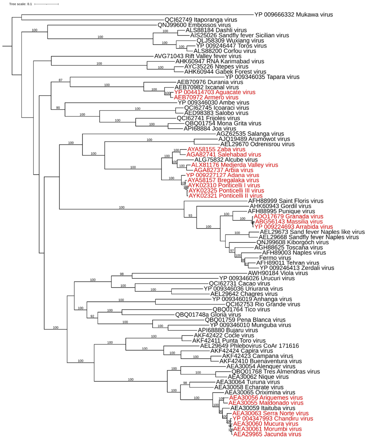
Figure 1. Midpoint rooted maximum likelihood tree obtained with amino acid sequences of the RdRp of available phleboviruses. Sequences in red: ascribable to the same species according the 95% identity threshold. Bootstrap values >85% are shown over the branch.