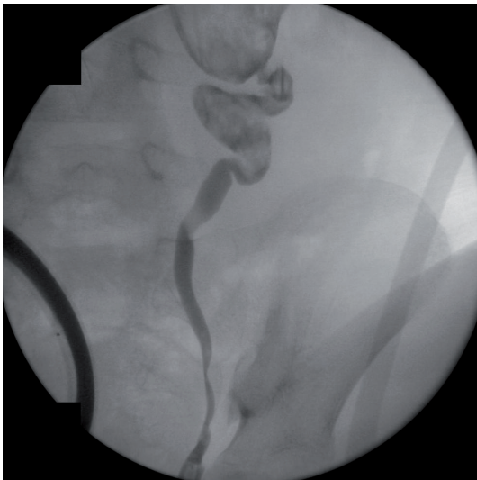
FIGURE 2: A retrograde pyelogram prior to surgery shows opacification of the dilated left renal collecting system with abundant internal debris noted within the renal pelvis and proximal ureter. The ureteropelvic junction appears narrowed, though obstruction elsewhere along the ureter and dilating reflux cannot be ruled out.

month of percutaneous drainage revealed that the left kidney had a differential function of 5%.