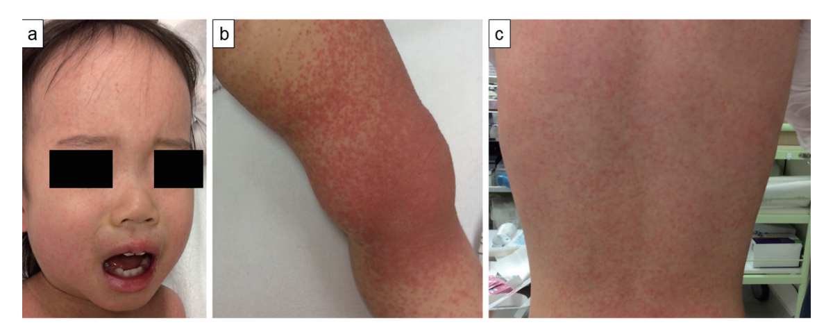
Figure 1. A 1-year-old Japanese girl with fever and skin rash. At admission, 4 days after symptom onset, photographs of patient's skin demonstrated rash on her face (a), left knee (b), and back (c). A fine papular erythema is visible.

child's body temperature was 39.1 °C, and she had no significant arthralgia or hepatosplenomegaly. She demonstrated bilateral cervical lymphadenopathy, redness of the lips, and a punctate rash on the extremities, trunk, and face with a partial fusion tendency (Fig. 1a-c). She did not reveal conjunctival hyperemia of the eye, erythema of the palm, or redness at the site of her bacillus Calmette-Guerin vaccination. Her hematological tests were normal. The peripheral white blood cell count was 5.76 \times 10^{9} /L, with 2.0% atypical lymphocytes (Table 1). No proteinuria or hematuria was observed. Blood biochemistry tests revealed increased levels of aspartate transaminase and lactate dehydrogenase and mild hyponatremia. In addition, increased levels of ferritin, soluble interleukin-2 receptor, and β2-microglobulin were found. Increased levels of D-dimer, indicating vasculitis, and N-terminal fragment of pro-B-type natriuretic peptide, a peptide secreted by cardiomyocytes during heart failure, were also observed. In contrast, C-reactive protein (CRP) and erythrocyte sedimentation rate (ESR) were not elevated. In the complement system, total hemolytic complement, C3, and C4 levels were low (Table 1). Anti-nuclear antibodies and anti-double-stranded DNA antibodies (antidsDNA Ab) were negative (Table 2). Total body enhanced computed tomography showed lymphadenopathy in the neck, axilla, and inguinal regions.