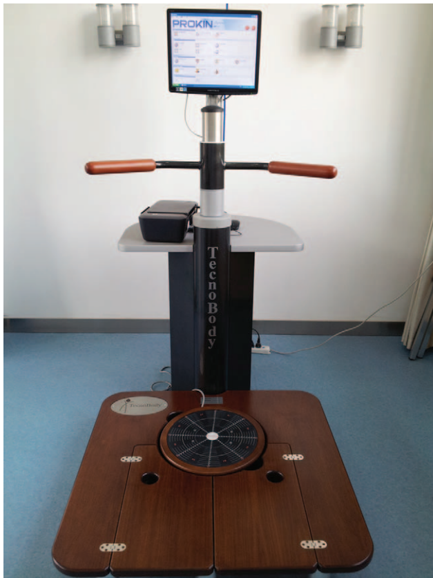
Figure 1. Pro-kin system.

the therapeutic methods used for this purpose, visual feedback training has been shown to be especially effective. [10–13] Previous studies [14–17] have highlighted the Pro-kin system (Fig. 1), a new type of commercially available computerized balance assessment and training system that provides the user with accurate visual feedback information about the position of the center of pressure (CoP). Liu [14] demonstrated that Pro-kin balance instrument training can promote the recovery of the balance function of stroke patients; furthermore, Li et al [15] reported that treatment with the Pro-kin balance system improved balance ability in stroke patients with hemiplegia.