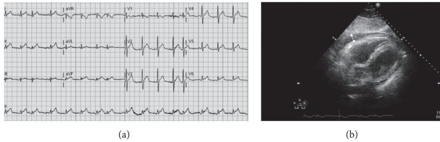
FIGURE 1: ECG and echocardiography at admission. (a) Twelve-lead ECG during admission shows sinus rhythm and premature atrial contractions in combination with diffuse ST-elevation, typical for acute pericarditis. (b) Ultrasound studies indicated moderate (<20 mm) pericardial effusion, here shown on the subcostal view and indicated with the white marker.