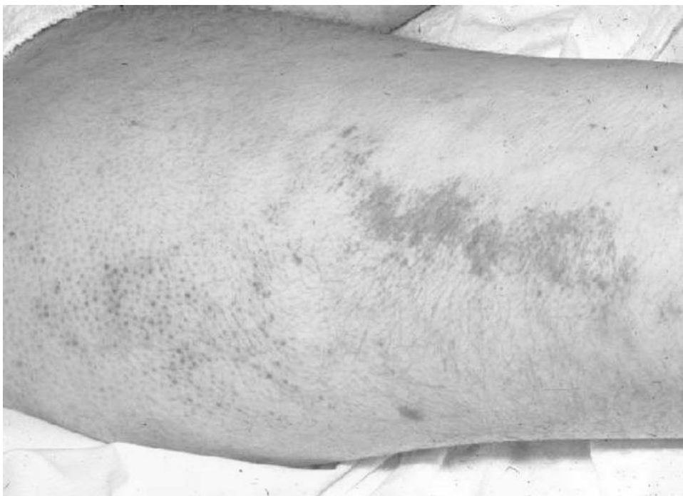
Figure 2.2. Petechiae and ecchymoses on lateral thigh of a patient with plague pneumonia, septicemia, and intravascular coagulation. This patient subsequently developed ischemia and gangrene of acral parts.

Presenting manifestations of septicemic plague in a case series of 18 patients in New Mexico (Hull et al. , 1987) include: