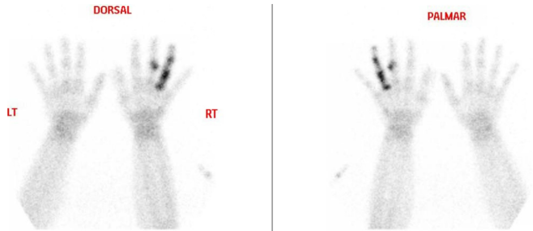
FIGURE 2: Bone scan of the hands.

An unenhanced CT scan of the right hand was obtained in control, axial, and sagittal reformats and demonstrated cortical and endosteal hyperostosis involving the proximal, middle, and distal third and fourth phalanges. It showed mild adjacent soft tissue bulge. However, the adjacent interphalangeal joints appeared unremarkable with no visible deformity. The above features were suggestive of the melorheostosis (Figure 3).