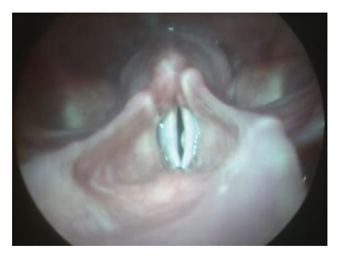
Fig. 2 Gelatinous polyp in the left vocal fold.

In this respect, the aim of the present study was to analyze the existing literature on vocal fold polyps published in the last 16 years.