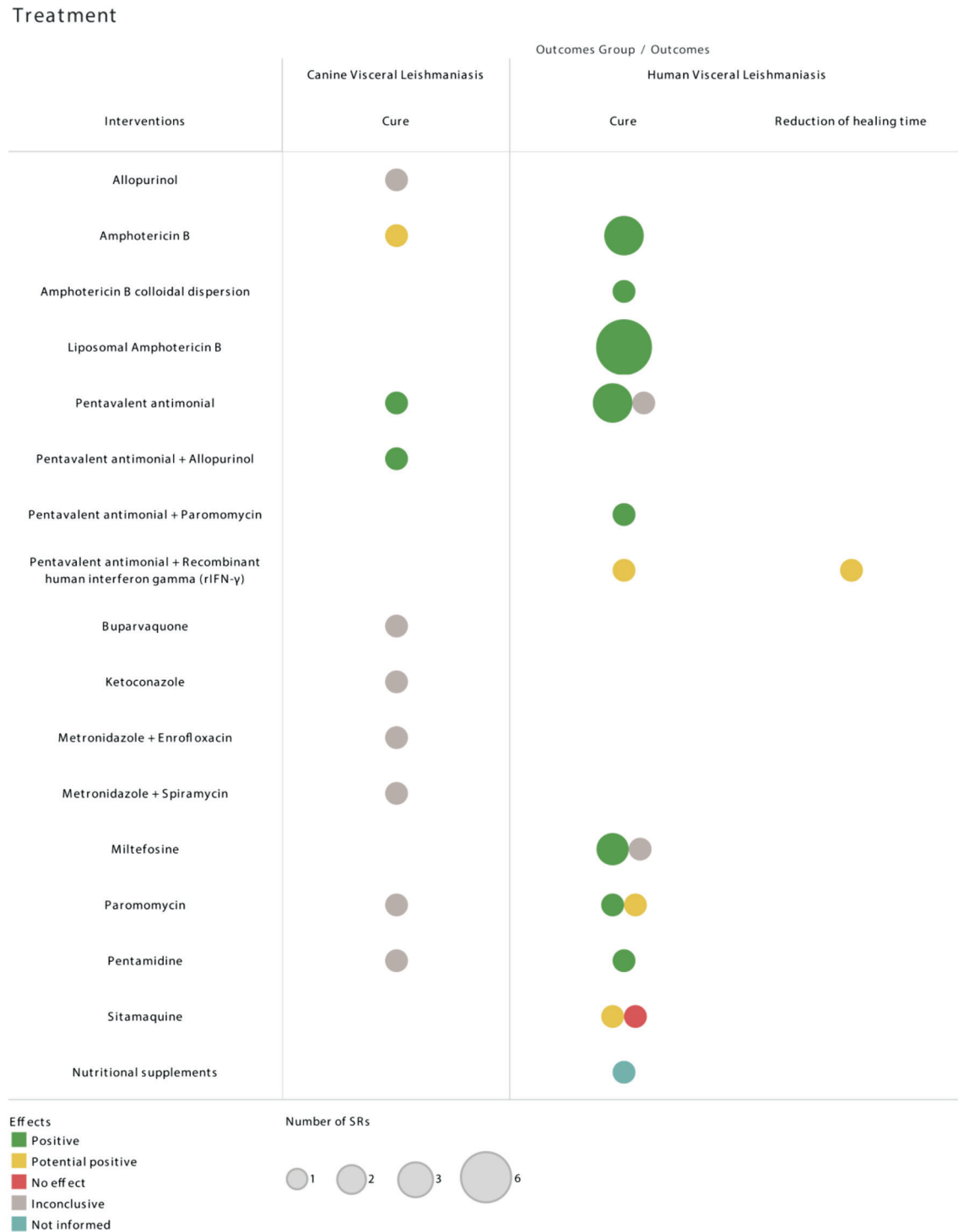
FIGURE 3. Effects of the treatment interventions on the respective visceral leishmaniasis outcomes

Notes: The interventions with "potential positive" effect need further studies to confirm the positive results. Amphotericin B and liposomal amphotericin B were considered the best treatment options for people with visceral leishmaniasis–HIV coinfection.