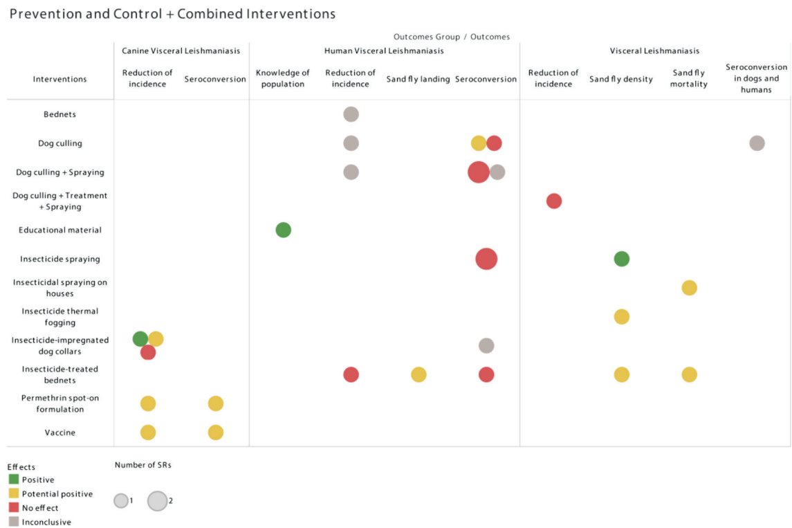
FIGURE 1. Effects of the prevention, control, and combined interventions on the respective visceral leishmaniasis outcomes

rKE16, remains inconclusive due to the low number of studies, which makes any recommendation unfeasible (30). The main challenges for serological tests for VL are HIV-coinfection and diseases with similar presentation. Although not evaluated in this study, parasitological tests are required for the diagnosis of VL in HIV-positive patients with symptoms resembling VL. The situation is also complex when severe diseases that lead to similar symptoms, such as leukemia and lymphoma, are a differential diagnosis. In these cases, a bone marrow examination can confirm or rule out these diagnoses.