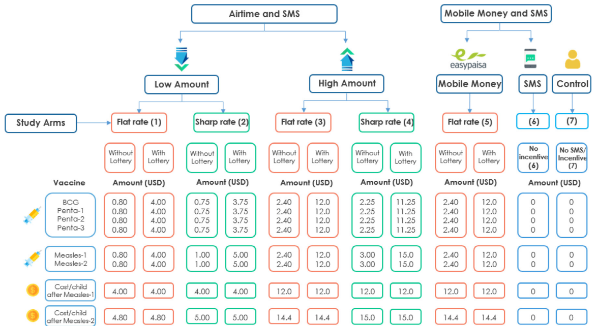
Figure 1. Trial design: children visiting a study immunization clinic for BCG, penta-1, or penta-2 vaccine were enrolled and followed up until at least 18 months of age in a seven-arm study comprising five mCCT arms with varying amounts (high or low), schedules (sharp or flat progressivity), design (certainty of payment), method of payment (mobile money or airtime top-ups) an SMS only arm and a control arm.

*We used an exchange rate of 1 USD=137 PKR (average exchange rate for the study duration) for the costs effectiveness analysis. Easypaisa is a trademark of Telenor Microfinance Bank.