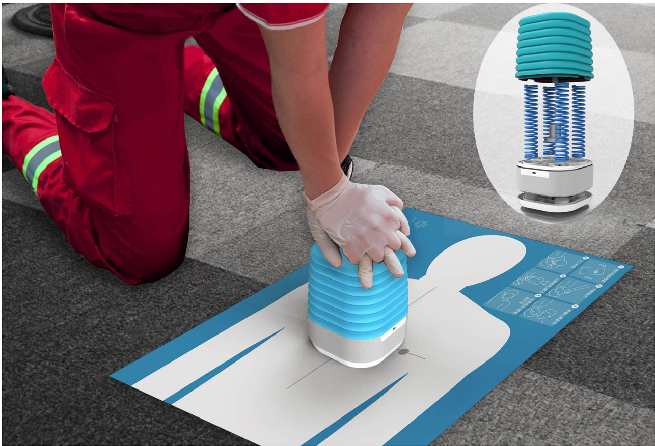
FIGURE 1 | The schematic diagram for the Soul Sheath™ training device. The device is composed of a cover made of silica gel, four springs and a base with a Bluetooth connector, and a sensor monitoring the distance of movement induced by the compression and the rate of compression. The speaker and the indicator light are also integrated into the base. There is also a sheet with a brief instruction of the cardiopulmonary resuscitation process and an upper half of a human shape to mark the position of chest compression.

under the supervision of the trainers. In the SS group ( n = 20 ), the participants were trained with the SS device similarly to the RA group.