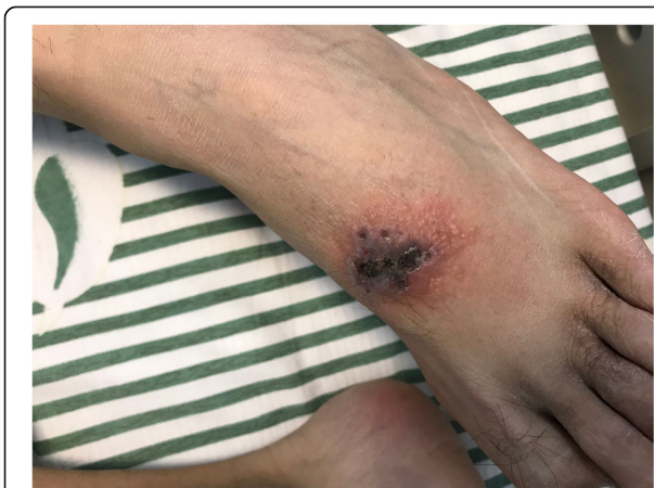
Fig. 1 Skin lesion on patient's left foot. There was a superficial ulcer on the dorsum of the left foot with partial necrosis and black crust, surrounded by a cluster of blisters

After his admission to our hospital, the main laboratory tests from blood samples were as follows: (1) white blood cell count: 9.41 \times 10^9 , N 0.67; (2) plasma procalcitonin < 0.1 ng/mL; C reaction protein: (3) negative serum cryptococcal antigen test; negative serum Treponema pallidum particle agglutination assay; negative serum tuberculosis antibodies; negative interferon- \gamma release assay; negative blood culture; (4) plasma CMV load: serum HBV load: 2.18 \times 10^8 copies/mL; (5) CD4 cell count: 137 cells/uL; plasma HIV load: 1.2 \times 10^6 copies/mL. His clinical condition was not improved with the above mentioned combinatory anti-infective therapy. On the third day of the hospitalization, a lumbar puncture was performed. The