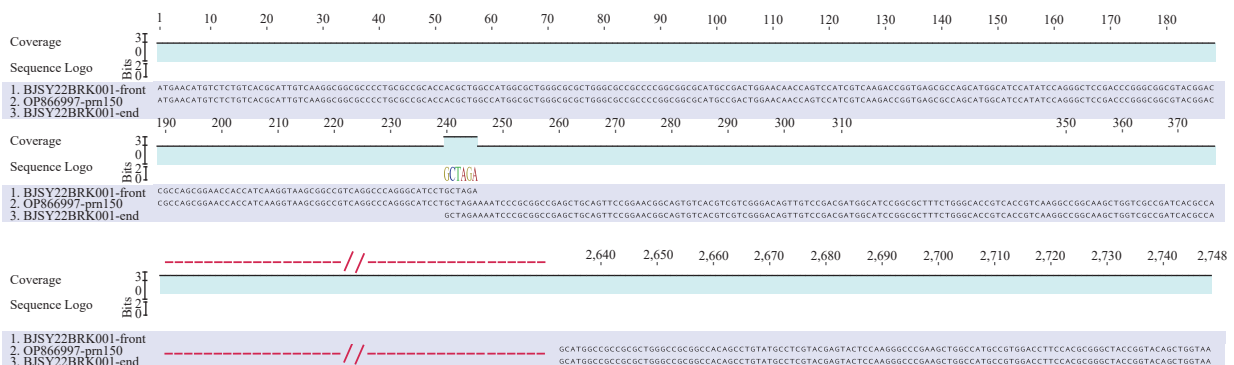
FIGURE 1. Comparison of the disrupted prn gene with the complete prn150 allele, highlighting six overlapping bases (GCTAGA) between the contigs. OP866997-prn150: intact prn150 .

Various mechanisms can result in Prn deficiency, such as mutations, deletions, and insertions within the prn gene. Cai et al. observed Prn-deficient strains in 11.7% of samples from Shanghai, characterized by