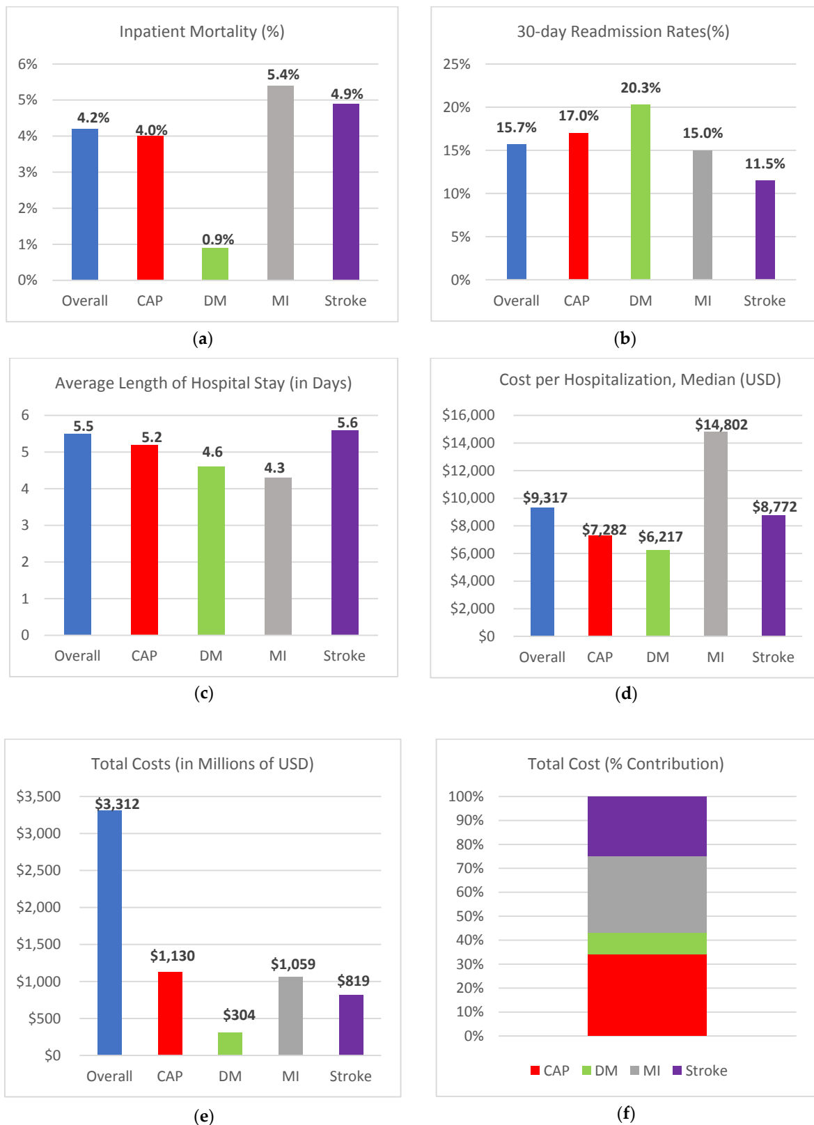
Figure 2. Comparison of hospitalization metrics for CAP, DM, MI, and stroke (a) Inpatient mortality; (b) 30-day readmissions rates; (c) length of hospital stay; (d) median cost per hospitalization; (e) total cost in millions of US dollars; (f) total cost in % contribution.