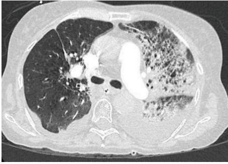
FIGURE 1: Representative axial CT for PE image of our patient upon admission to the intensive care unit showing dense airspace opacities involving predominantly the left upper lobe and small pleural effusion.

mass as well as to several metastatic spine lesions in the cervical and thoracic spine during 2017. Follow-up staging imaging did not show any evidence of radiation pneumonitis or fibrosis. In early 2018, she underwent biopsy of metastatic liver lesions, found to be adenocarcinoma of the lung primary with EGFR exon 19 deletion and T790M mutations. In April 2018, she was started on Osimertinib 80 mg daily, which she tolerated well for approximately four months. A staging CT was completed in June of 2018, which showed response to therapy as evidenced by a decrease in size of the right infrahilar mass, adenopathy, pulmonary nodules, and hepatic metastases. In addition, her previously noted brain metastasis was no longer seen on her brain MRI. In August 2018, she required an admission to an outside facility due to symptoms suggestive of congestive heart failure. She was diuresed and diagnosed with nonischemic cardiomyopathy. Her heart failure remained well compensated on goal-directed medical therapy and diuretics. Other past medical history is notable for hypertension, acid reflux, emphysema, and iron deficiency anemia. She is not prescribed any antiplatelet or anticoagulation agents. She has several allergies to antibiotics and was previously intolerant to subcutaneous heparin.