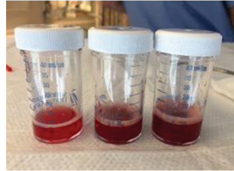
FIGURE 2: Initial sequential lavages from the patient's lingular segment demonstrating obvious DAH.

The patient was admitted to our facility in September 2018 due to progressive dyspnea, fatigue, and weakness of several weeks of duration. She was initially managed as hospital-acquired pneumonia in an immunocompromised host with broad-spectrum antimicrobials, aggressive bronchodilators, and intravenous corticosteroids. Within 24 hours of admission, transfer to the intensive care unit was facilitated due to worsening respiratory distress requiring noninvasive positive pressure ventilation which eventually progressed to require mechanical ventilation. At this time, her exam was remarkable for predominant left-sided rhonchi and rales. Laboratory analysis was unremarkable except a severe acute respiratory acidosis of pH 7.18 and PCO_2 of 54 mmHg. Upon arrival, her WBC count was 7.6 \times 10^3/\mu\text{L} , hemoglobin was 8.5 g/dL, and platelets were 305 \times 10^3/\mu\text{L} , and she had normal coagulation panel and B-type natriuretic peptide (BNP). A CT chest with contrast demonstrated a consolidation in the left lung suspicious for pneumonia and small effusions bilaterally with associated atelectasis (Figure 1). Her antibiotics were continued.