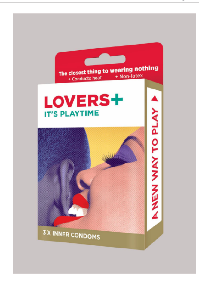
Figure 2 Lovers+ inner condoms.

This review used peer-reviewed literature, country surveys, and other sources available via the Internet, and is thus subject to these limitations. Papers and reports outside our language scope would not be represented here. The fact that most research to date has been conducted with the discontinued FC1 suggests that some results may lack relevance to current programming. Our study was not intended to be a systematic review, and therefore did not include a complete count of articles retrieved and rejected. Scoping studies represent a broad approach to a topic, where the aim is to map a wide range of literature and identify the nature, range, and extent of the evidence. Some qualitative reports reviewed here were based on small sample sizes, although most were based on greater than 100 participants. Finally, the fact that our paper selected developing countries as a focus should not be construed to mean that the FC is not appropriate or acceptable for women in developed countries, as considerable literature has already shown.