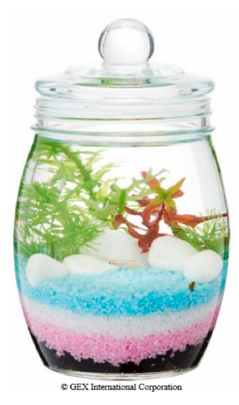
Figure 1. An Example of a Bottleium. One fish and one water snail are allowed in each bottle. An aeration and filtering system is not required.

Fish might be an alternative to mammalian pet ownership if provided with suitable culturing equipment. The conventional study was conducted with fully equipped domestic fish tanks [14]. Maintaining the filtering system and changing large volumes of water can eventually become difficult for older adults. To solve this problem, a novel type of aquarium named "Bottleium", a neologism using the term bottle and aquarium, was selected (Figure 1). The Bottleium uses a small-size glass bottle that one can easily move. It does not require filtering or an aeration system. One fish and one water snail are allowed in each bottle and oxygen to the animals is provided by the water plant planted in the center of the bottle. Fishes cultured in the Bottleium live for few years, which is equivalent to their original life span. The size and ease of maintaining the Bottleium could enable ownership by older adults.