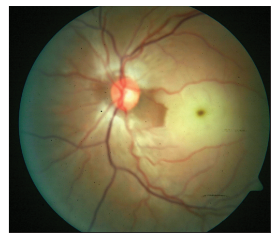
Figure 3: Fundus picture of the left eye with intensely pale and edematous macular and cherry red spot in the fovea. The nerve fiber layer surrounding the disc is also affected. Arteries are narrowed

cases. We hypothesize that in both patients an embolic phenomenon was the cause of acute obstruction to the CRA.