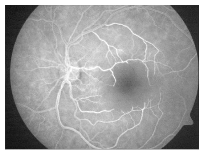
Figure 4: Fundus fluorescein angiography of patient B's left eye showing severe avascularity of the macular

Other described vitrectomy techniques for treating RAO include retinal artery massage, CRA cannulation with microneedle, bloodletting, embolectomy, and regulation of intraocular hypotony.<sup>[9-13]</sup> Our surgical technique appears straightforward and can be undertaken by any vitreoretinal surgeon, requiring no additional surgical maneuvers or skill other than performing a standard removal of the vitreous. Although both patients opted for and had a general anesthesia, this procedure can be safely performed utilizing a local monitored anesthesia. There was a preoperative assessment and a medical clearance for general anesthesia by the medical team and anesthetist before the anesthesia was commenced as is the protocol of the hospital. It was determined that the anesthetic risk was no more than the usual for any other patient. The exaggerated anxiety state of the patients was another factor favoring a general anesthesia.