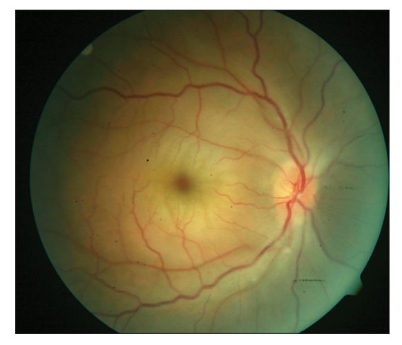
Figure 1: Fundus picture of the right eye showing the cherry red appearance of the fovea and opaque edematous macula. Arteries are significantly narrowed, and there is some disc swelling

IOP was 6 mmHg (he was on topical ocular hypotensive; G. Alphagan and G. Cosopt). He had macula optical coherence tomography (OCT), OCT angiography (OCTA), and fundus fluorescein angiography (FFA) which were all consistent with a diagnosis of right eye CRAO. Erythrocyte sedimentation rate (ESR) was normal, suggesting a nonarteritic form of CRAO. All blood works for thrombophilia were also normal.