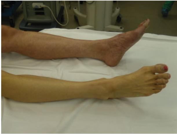
Fig. 1 Cyanosis of affected left limb.

Intraoperative duplex ultrasonography demonstrated marked dilatation of the left common femoral and external iliac vein. Additionally, the left popliteal and tibial veins were markedly dilated and noncompressible, suggesting extensive iliofemoral thrombosis. Phlegmasia cerulea dolens and May–Thurner syndrome were diagnosed. Given the extensive thrombus and severity of ischemia, the patient underwent four-compartment fasciotomy with left iliofemoral venous thromboembolectomy, left popliteal and tibial vein embolectomy, chemical and mechanical thrombolysis of left common iliac vein with a Trellis device, balloon angioplasty of the left common femoral vein, and placement of a left iliac vein stent (→ Fig. 2 ). At the completion of the procedure, the patient gained reestablishment of perfusion in the left lower extremity.