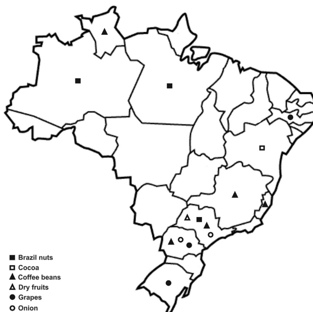
Fig. 2. Brazilian map depicting the locations from which samples were obtained.