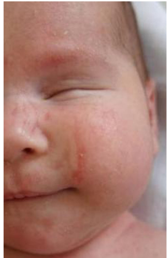
Fig. 1 An infant girl with left-sided anophthalmia and skin defect on the cheek

In this paper we report an infant girl with a mosaic interstitial Xp22.2 deletion. A newborn presented with typical clinical signs of MLS syndrome – congenital