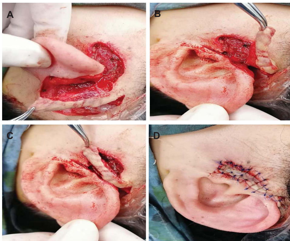
Figure 1 (A) Posterior auricular skin flap preparation; (B) a transfer of the posterior auricular skin flap to the front of the ear; (C) repair of the preauricular defect with the posterior auricular skin flap; (D) surgical site appearance after the flap suture.

transplanted from the posterior auricular to repair anterior defects. In this case, a posterior auricular flap was prepared after resection of the preauricular fistula and infected tissue (shown in Figure 1A), the size of the flap must be able to completely cover the preauricular defect and to ensure that there is no tension during suture. The blood supply of the flap could not be damaged. Then, we rotated the flap from the back of the ear to the front of the ear to cover the defect. During the rotation, the bottom of the flap must be carefully treated to avoid any twisting, which would damage the blood supply of the flap (shown in Figure 1B). The next operation is to cover the defect using the prepared flap, the bottom of the flap will be sutured to exclude any possible dead space (shown in Figure 1C). At the end, the flap could be sutured as shown in Figure 1D.