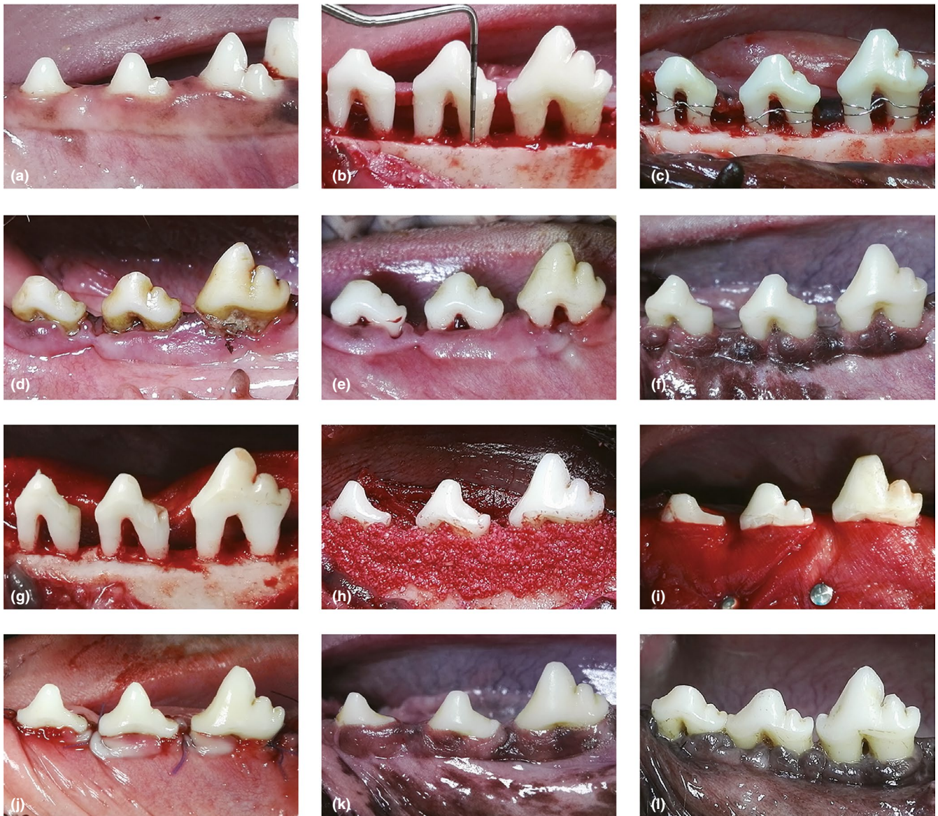
FIGURE 1 The experimental procedures in the mandibular teeth (the second, third, and fourth mandibular premolar). (a) preoperative observation; (b) the surgically created supra-alveolar periodontal defect; (c) the root was ligatured with wire to prevent spontaneous healing and enhance plaque accumulation; (d) chronic periodontitis 8 weeks after ligation; (e) initial periodontal therapy including scaling and daily plaque control; (f) clinically healthy gingiva after four weeks' stabilization period; (g) before bone augmentation; (h) application of bone grafts; (i) placement of barrier membrane; (j) sutured coronal to the cementum-enamel junction; (k) clinical observation in the BMP-2/BioCaP + barrier membrane group 8 weeks after the reconstructive surgery; (l) clinical observation in the BioCaP + barrier membrane group eight weeks after the reconstructive surgery

in this dosage had superexcellent osteogenic capability when they were filled in all kinds of bone defects. All these procedures were conducted under sterile conditions.