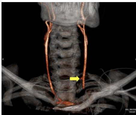
Figure 2. Three-dimensional reconstruction with pseudoaneurysm (arrow) of the common carotid after a stab wound to the neck.

structures, allowing more accurate operative planning (Figure 2).