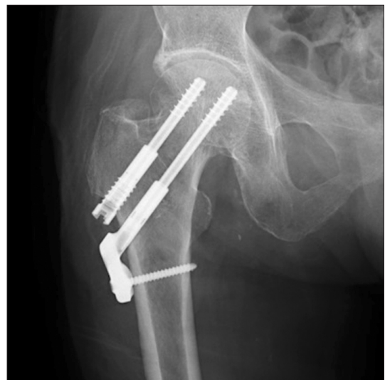
Fig. 3. Postoperative X-ray image of a dual SC screw. The plate barrel was used as a mini-compression hip screw along with a thread barrel used as an anti-rotation screw.

This study was approved by the Institutional Review Board of the authors' affiliated institution (IRB No. 2018-13). DSCS was used for femoral neck fractures in 196 hip joints (190 patients) at our hospital between November 2005 and June 2017. As this study is retrospective, patients were not required to give written informed consent to the study. We also applied the opt-out method to obtain consent on this