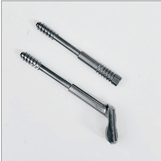
Fig. 1. A dual SC screw comprises a slidable screw and a barrel with a thread (thread-barrel) or with a one-hole plate (plate-barrel). The anatomical angle of the plate and the screw of the plate barrel is set at 135°.

The dual SC screw (DSCS; KiSCO, Kobe, Hyogo, Japan) was developed as an implant with the advantages of both the MS and CHS devices 11) (Fig. 1). It comprises a screw and a barrel, a two-piece structure. The screw can slide within the barrel, and by advancing the screw only