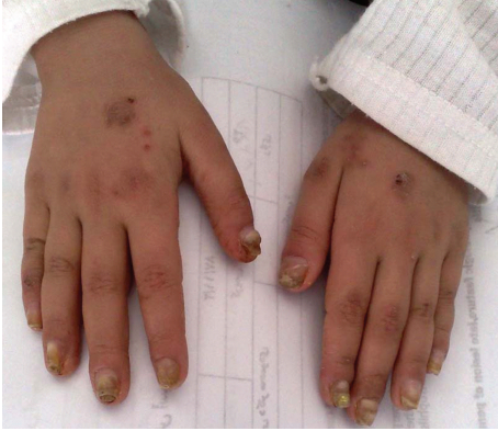
FIGURE 1: Wedge-shaped thickening, subungual hyperkeratosis, and discoloration of finger nails.