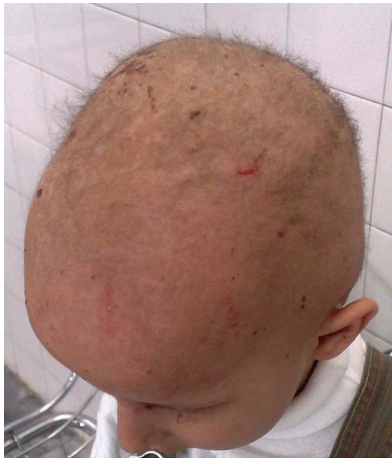
FIGURE 2: Angular cheilitis.