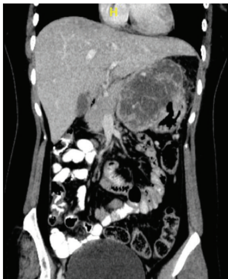
FIGURE 1: CT coronal section of the abdomen and pelvis showing a well-defined solid-cystic mass along lesser curvature of the stomach.

enhancing solid components interspersed within. Multiple enhancing intratumoral vessels were present. Mass was seen abutting the inferior surface of the left lobe of the liver superiorly, the pancreatic body posteroinferiorly with no definite invasion. There was no loss of fat plane with adjacent structures. No lymphadenopathy or ascites was noted.