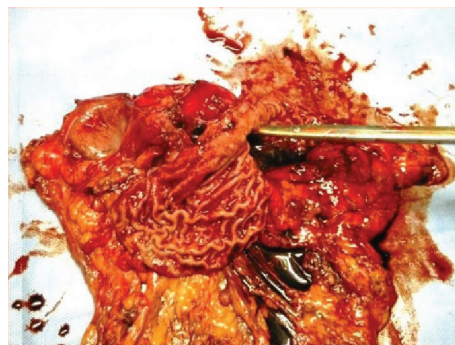
FIGURE 3: Surgical specimen shows the stomach with tumour.

80-85%), consistent with Ewing's sarcoma. Hematoxylin and eosin staining showed characteristic uniform cells with the round nuclei, small nucleoli with scant-to-moderate clear cytoplasm (Figures 4(a) and 4(b)). Margins were free of tumour. Omentum was noted to have focal tumour deposit. Eight perigastric lymph nodes with reactive hyperplasia. On immunohistochemistry, the tumour cells were diffusely positive for CD99 (Figure 4(c)). In view of poor response to chemotherapy, following discussion with the multidisciplinary tumour board, it was decided to rule out anaplastic large-cell lymphoma. Pathologist had a re-look at her biopsy and surgical specimen slides. Lymphoma and GIST IHC panel was negative. FLI-1 was positive on immunohistochemistry (Figure 4(d)). Reverse transcription polymerase chain reaction (RT-PCR) on the gastric resection specimen was negative for EWS-FLI-1 types 1 and 2, EWS-ERG, and EWS-FEV translocations. After ruling out epithelial tumours, rhabdomyosarcoma, lymphoma, and GIST, the likelihood of having a RT-PCR negative Ewing's sarcoma that is known to have an incidence of 10-15% was considered.