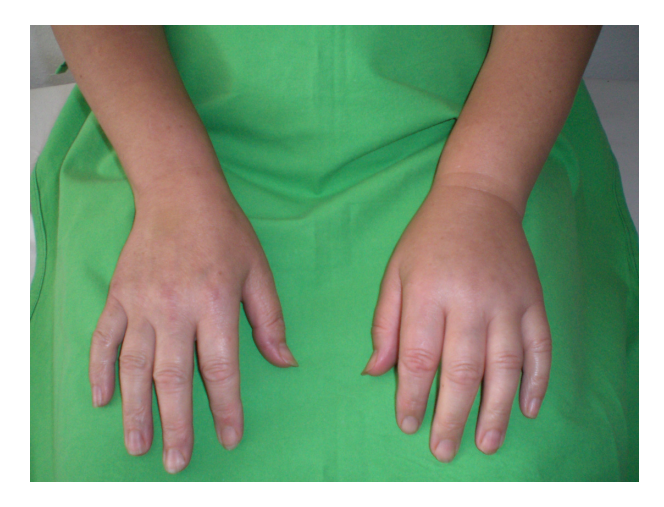
Figure I Subcutaneous edema on the left hand of a patient with HAE-CI-INH.

As HAE is a hereditary disorder, gene therapy would be the optimal and definite solution; however, it is not yet available.