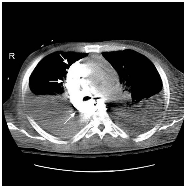
Figure 3 CT scan of chest with arrows showing the contrast in the mediastinum.

The authors declare that they have no competing interests.