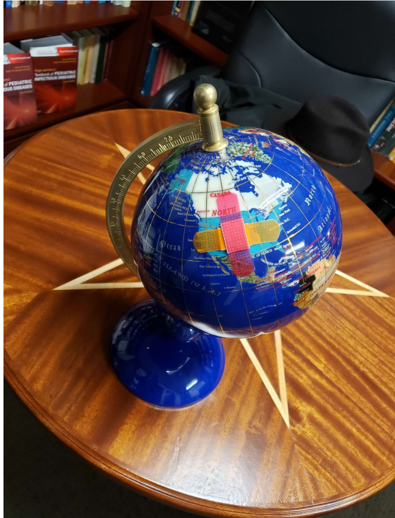
Fig 1. Tikkun olam—Repairing the world.

https://doi.org/10.1371/journal.pntd.0007117.g001