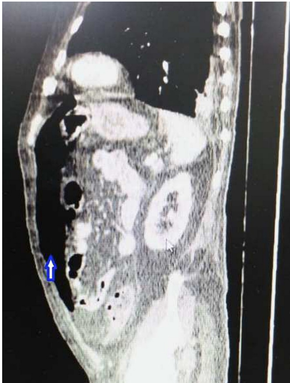
FIGURE 2: Abdominal CT shows massive pneumoperitoneum in the anterior part of the abdominal cavity