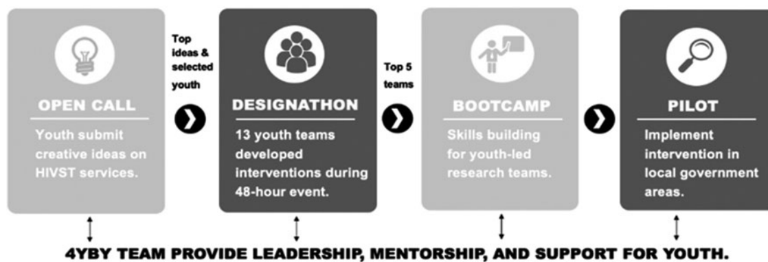
FIG. 1. The steps for the 4YBY intervention development process. 4YBY, 4 Youth by Youth.

a crowdsourcing open call over a 7-week period, where we solicited concepts and strategies to promote HIVST. We used the WHO/TDR practical guide on crowdsourcing to inform the open call. 25