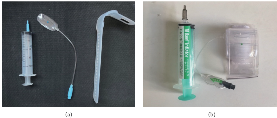
FIGURE 1: Study devices. The new radial artery hemostatic device which based on the patent design (a) and the Terumo TR Band™ (b).

groove of the silicone wristband, so the mark point of the bar could be aligned with the puncture point, and the entire compression device was fixed on the wrist by adjusting the position of the buckle.