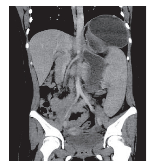
FIGURE 1: Coronal computed tomography scan of the abdomen showing marked gastric distension and splenomegaly.

Helicobacter pylori and chronic active gastritis, but were negative for AFB.