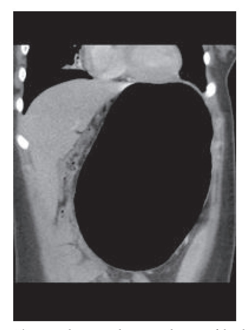
FIGURE 3: The coronal computed tomography scan of the abdomen showing persistent gastric dilatation.

pulmonary infection and possibly disseminated MTB given selectivity of the culture medium.