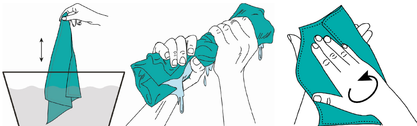
Fig 2. Second set of images used in the focus group discussion.

https://doi.org/10.1371/journal.pone.0216237.g001