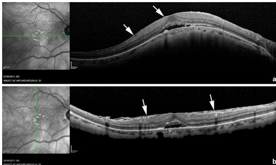
Fig. 1. The initial OCT horizontal scan showed a macular bulge with a maximal height of 760 \mu\text{m} measured (a). On the vertical scan, there was no macular bulge: the horizontal axis was the most cambered on SD-OCT Spectralis HRA OCT® (Heidelberg Engineering, Heidelberg, Germany), indicating that this DSM had a vertical oval-shaped pattern (b). An SRD was present and an epiretinal membrane could also be observed on both vertical and horizontal OCT scans.