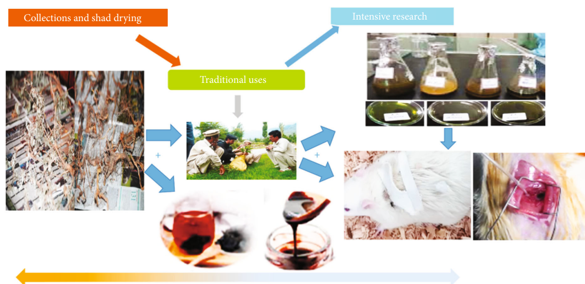
FIGURE 3: Mechanism of Seriphidium kurransense from traditional medicine to in vivo analysis.