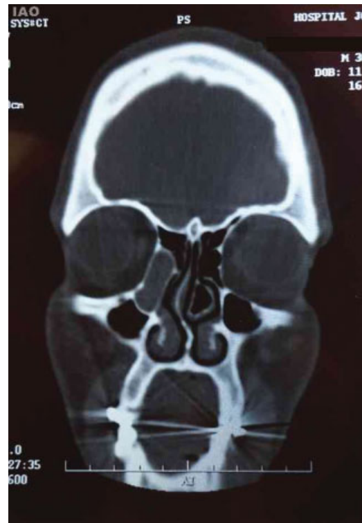
Fig. 2 Computed tomography of the paranasal sinuses, coronal section, in bone window, showing hypodense cystic lesion in the right nasolacrimal duct topography.