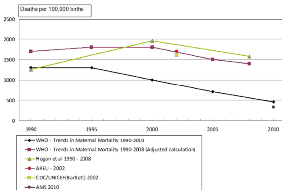
Figure 2 Reported maternal mortality ratios, Afghanistan (1990–2010). NB: Adapted from [6,25,27,35,38].

AMS figure should be increased by 50–100% (KI2). WHO's MMR estimate of 1,400/100,000 for 2008 was used in the 2011 State of the World's Midwifery (SOWM) report, but this was reduced to 400/100,000 in 2013 in the 2014 report [15,37].