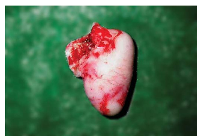
Fig. 3: Grayish-white specimen with hair growth on its surface

Based on the histopathological findings, a final diagnosis of hairy polyp was given. The postoperative course was uneventful and the patient was discharged on 5th postoperative day. On follow-up the patient is free of disease, with normal feeding and without evidence of recurrence after 6 months.